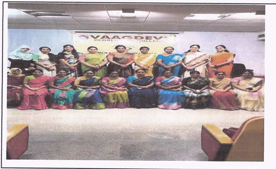
International Women's Day Celebrations