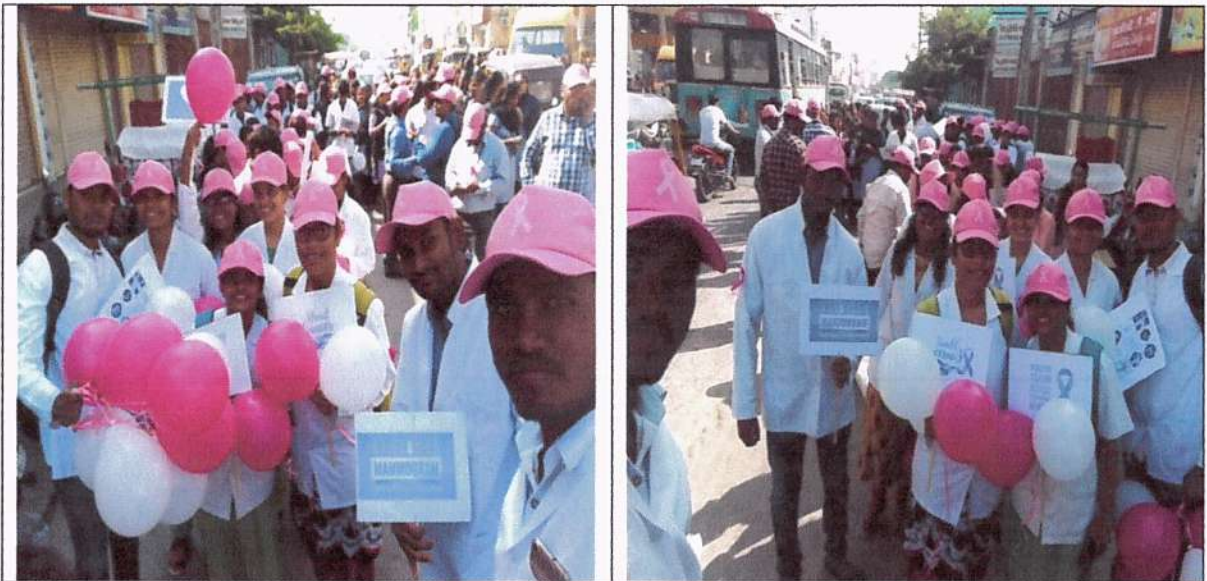
Breast Cancer Awareness Rally on the occasion of World Cancer Day