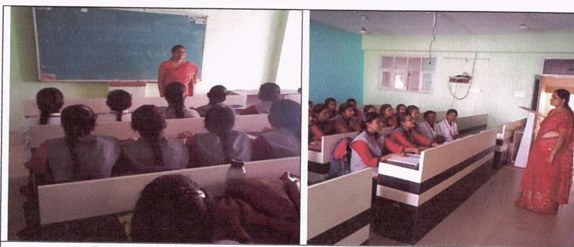
Let's Educate and Empower Women to Enlighten World