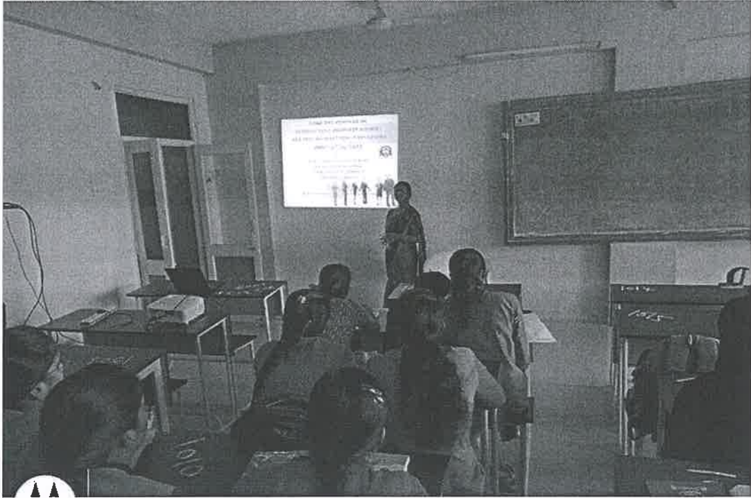
Faculty lecture through power point presentation

(Approved by AICTE & PCI, New Delhi & affiliated to Kakatiya University, Warangal, T.S) Ramnagar Dist. Hanamakonda- 506001, (T.S)