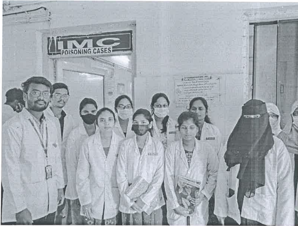
Acute Medical Care at MGM Hospital visit on 26/02/2024

(Approved by AICTE & PCI, New Delhi & affiliated to Kakatiya University, Warangal, T.S.) Ramnagar Dist. Hanamakonda- 506001, (T.S)