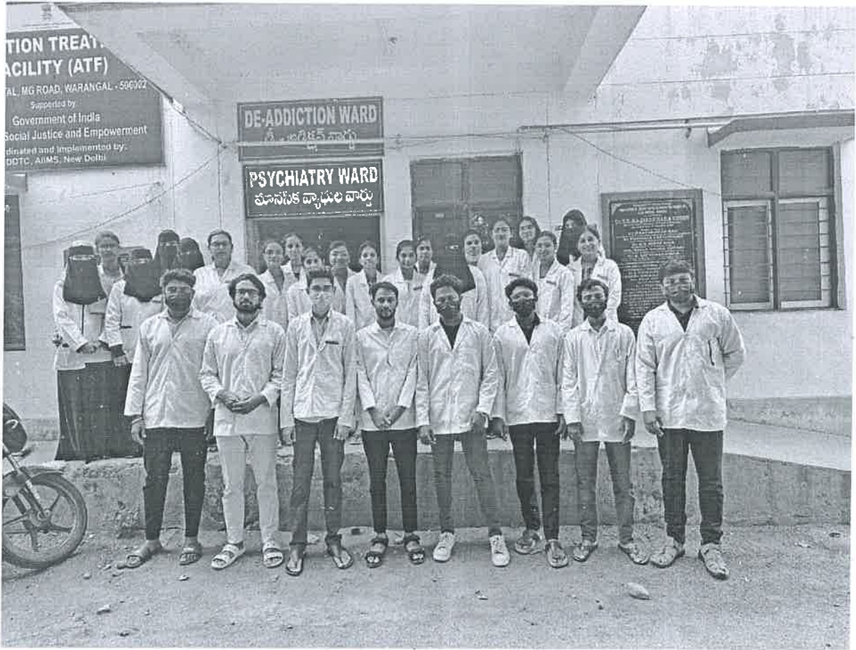
Deaddiction center at MGM Hospital visit on 26/02/2024

(Approved by AICTE & PCI, New Delhi & affiliated to Kakatiya University, Warangal, T.S) Ramnagar Dist. Hanamakonda- 506001, (T.S)