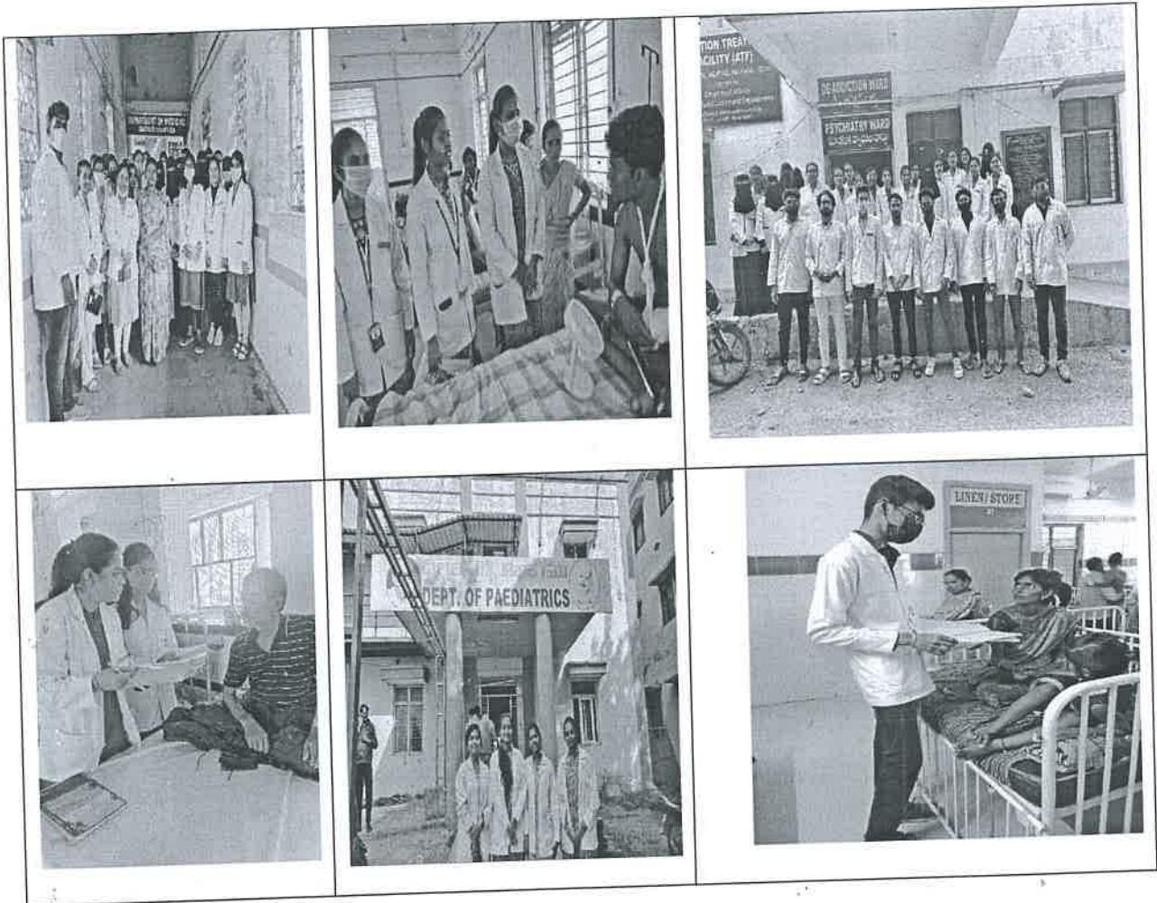
MGM Hospital visit of B. Pharmacy 1 st year on 22/02/2024

(Approved by AICTE & PCI, New Delhi & affiliated to Kakatiya University, Warangal, T.S) Ramnagar Dist. Hanamakonda- 506001, (T.S)