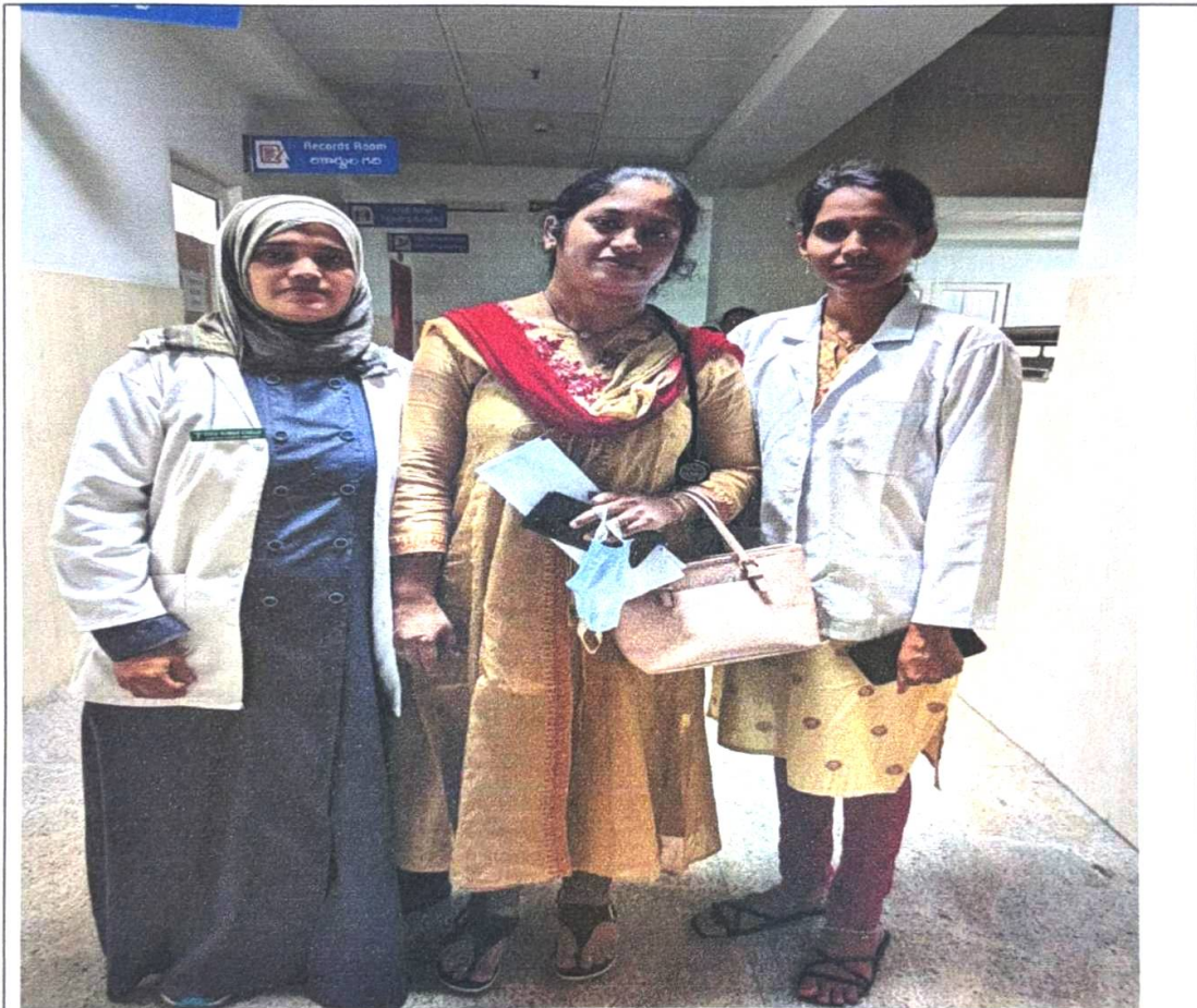
Internship & Project work for Pharm.D. students