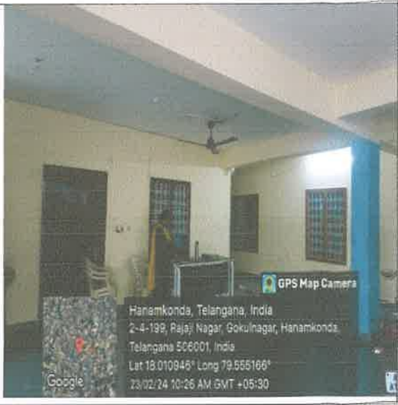
Girls Hostel Facility