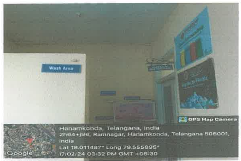
Girls Wash Room