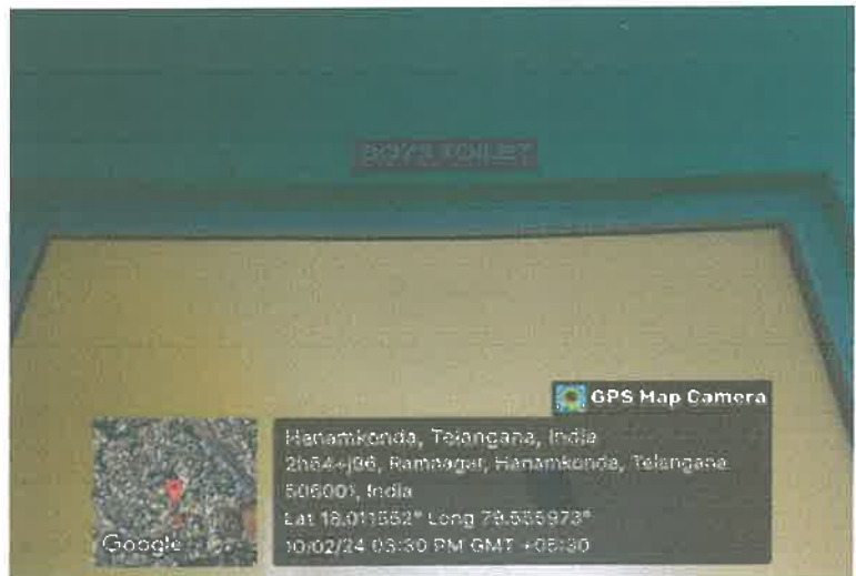
Boys Wash Room