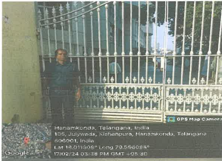
Security Guard at the Entrance of College Campus