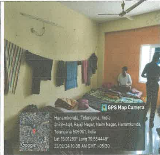
Boys Hostel Facility