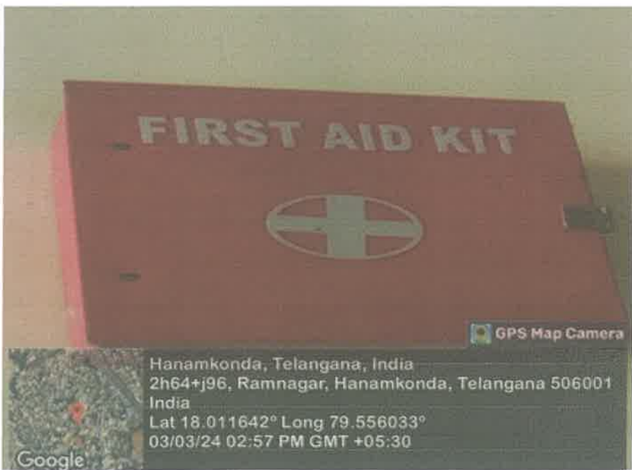
First Aid Box