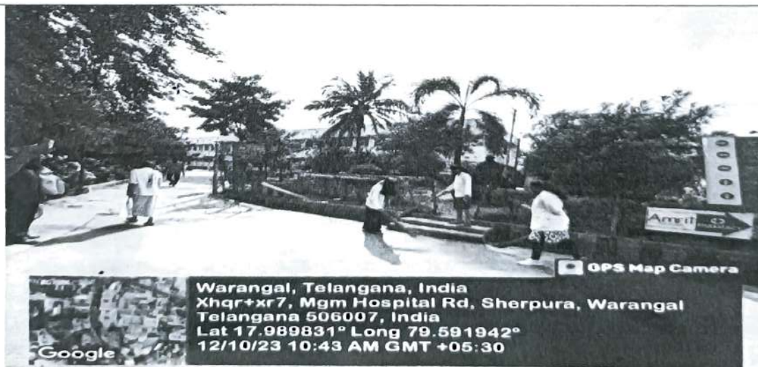
Swachh Bharath Programme in 12-10-2023