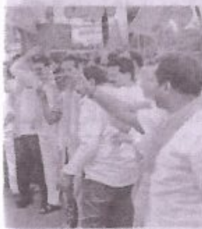
ఆర్ఎస్ పార్టీ నాయకులు

గా, నకాలంలో ఆన్లైన్, దేశ వెంట నడవ పులకు ఉచిత