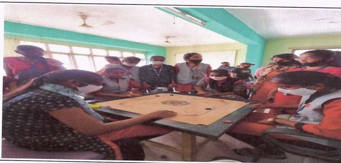
Carroms Competition for Girls