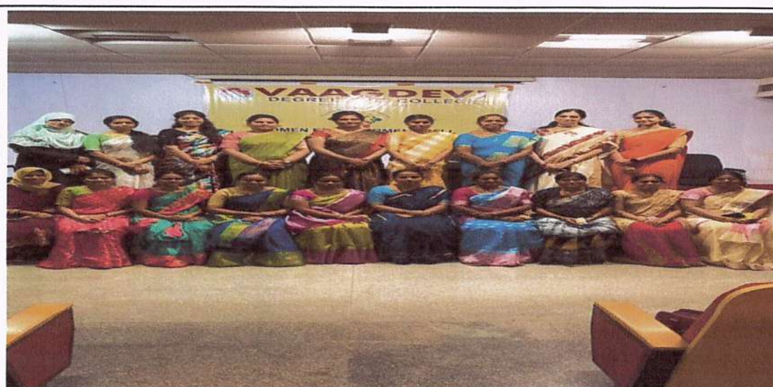
Women's Day Celebrations