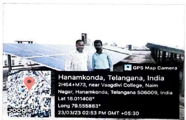
Investigative parameters – Energy Management – Solar panels and electrical appliances