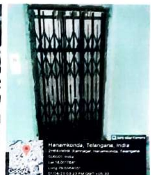
Investigative parameters – Ecological Management – Wheelchair, Ramp and Plantations