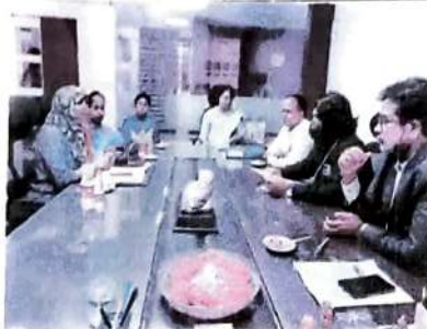
Meeting with the core team

Document objective: Proof of the Site visit