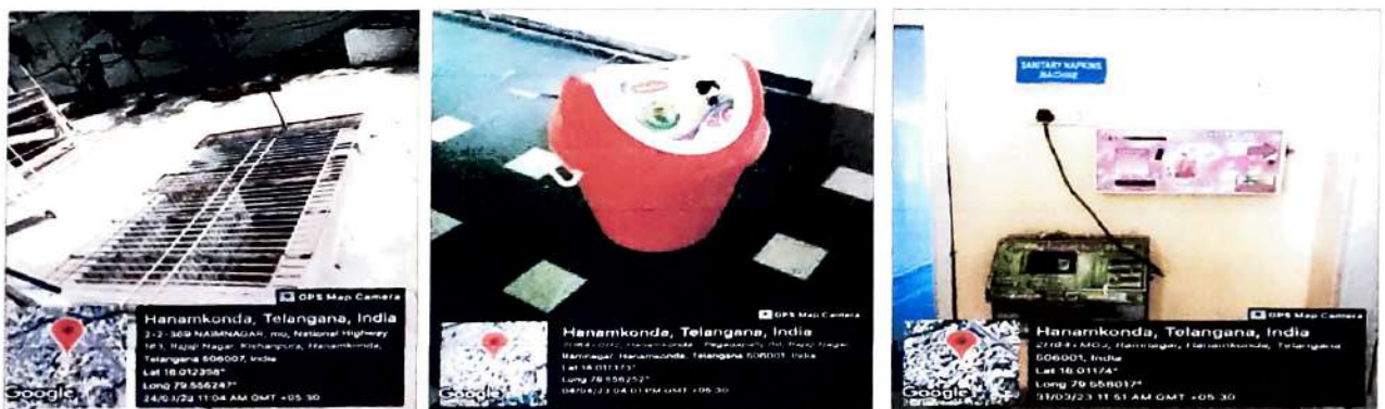
Investigative parameters – Water & Waste Management – Rain water harvesting pit, Dustbins & vending machine