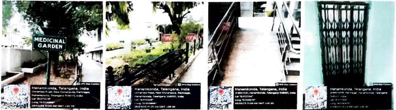
Investigative parameters – Ecological Management – Wheelchair, Ramp and Plantations