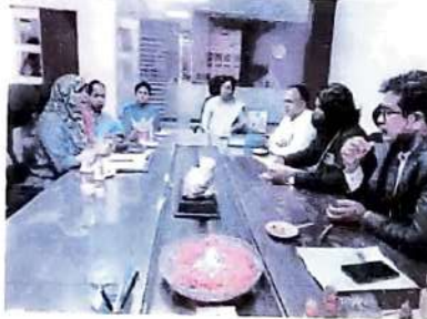
Meeting with the core team