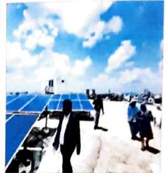
Meeting with the core team, group photo with the team and site investigation