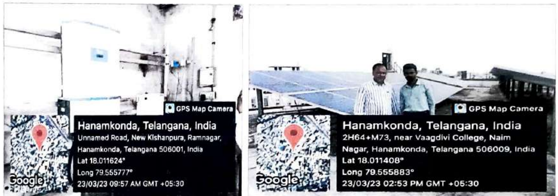
Investigative parameters – Energy Management – Solar panels and electrical appliances