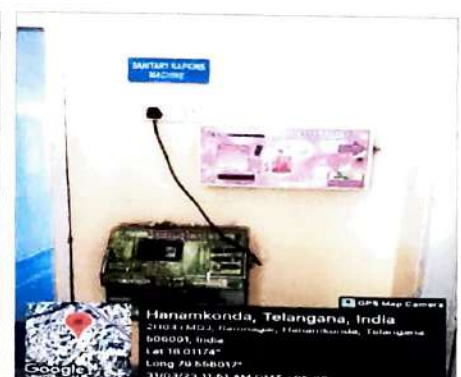
Investigative parameters – Water & Waste Management – Rain water harvesting pit, Dustbins & vending machine