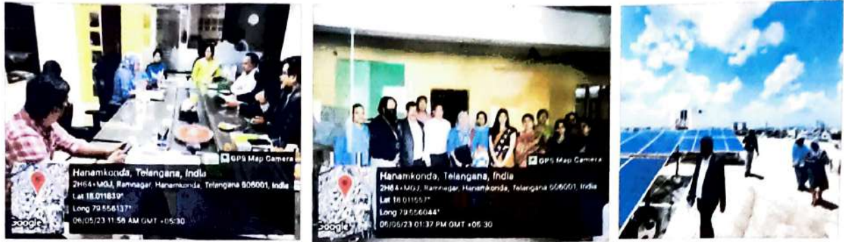
Meeting with the core team, group photo with the team and site investigation